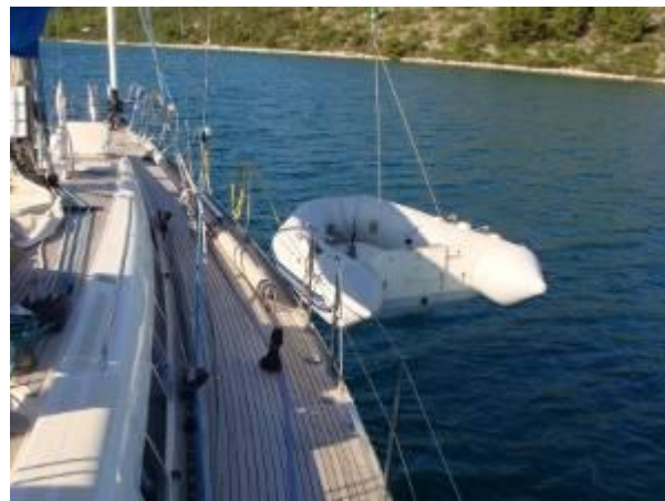
Dinghy storage large yacht style